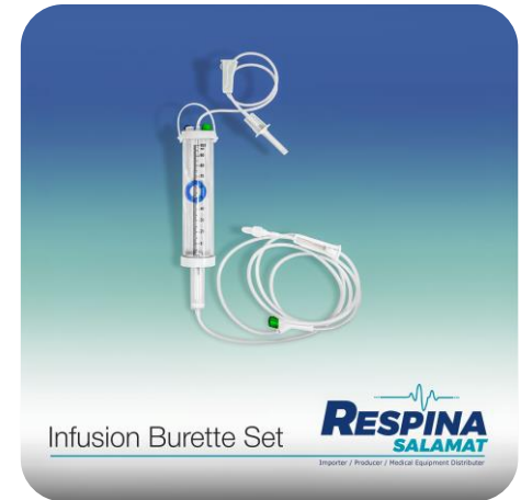
Infusion Burette Set

Importer / Producer / Medical Equipment Distributor