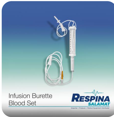
Infusion Burette Blood Set

Importer / Producer / Medical Equipment Distributor